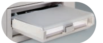
250-sheet paper cassette