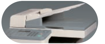
Automatic Document Feeder

You can use the FAX-L400 as a highly productive 14 pages per minute laser printer. It also functions as a high quality flatbed digital copier, for copying or faxing book and magazine pages as well as all your regular work. Plus you get all the benefits of digital copying - including electronic sorting, 2-on-1 copying and scan once print many. All in one fast and efficient unit.