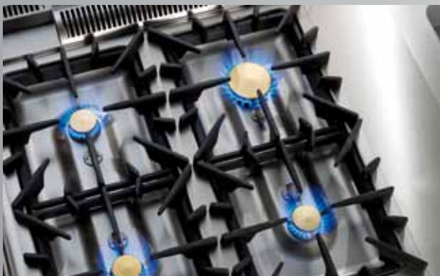
1-piece pressed well with cast iron grids. Model shown with 3x6kW and 1x10kW burners