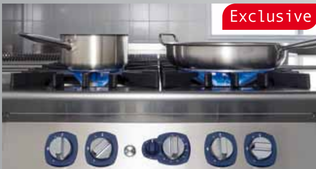
Exclusive "flower flame" burners