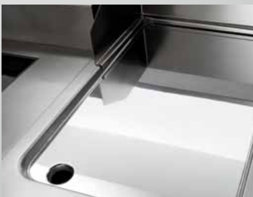
1-piece pressed cooking surface with large drain hole