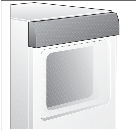
Clean lint screen after every load.