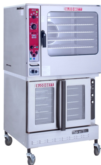
BCX-14G stacked on DFG-200

Or you can stack the BCX-14/BX-14 combi on our industry gold standard setting DFG 200, Zephaire, or Zephaire Plus convection ovens.