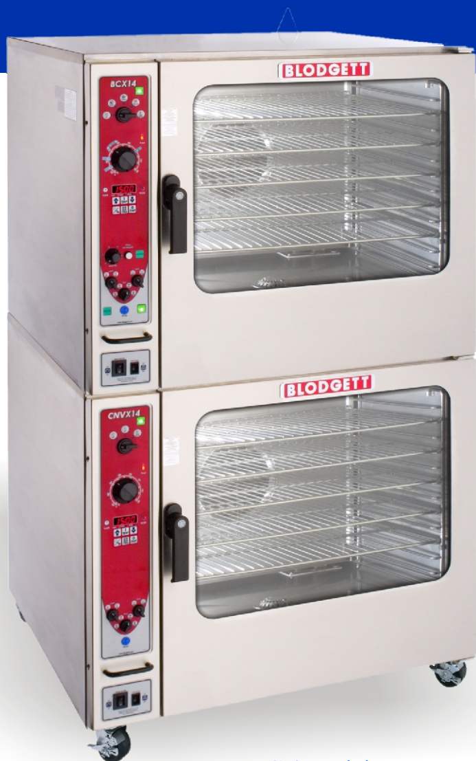
BCX-14E stacked on CNVX-14E

Want the capacity and versatility of both convection and combi? Blodgett Combi and Blodgett Oven offer the industry's largest selection of Mix and Match Combi's and Convection Ovens to meet your, needs, style of cooking and budget.