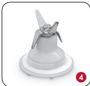
KBL180 Model Shown