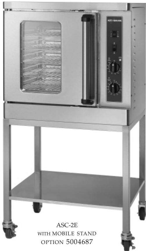
ASC-2E WITH MOBILE STAND OPTION 5004687