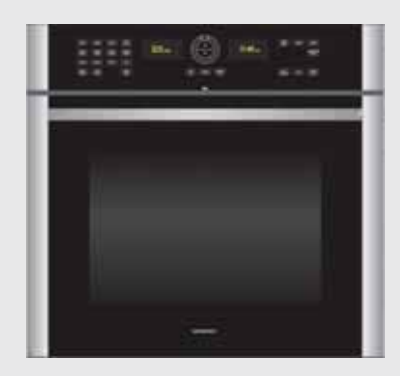
iSlide™ Convection Electric Single Oven