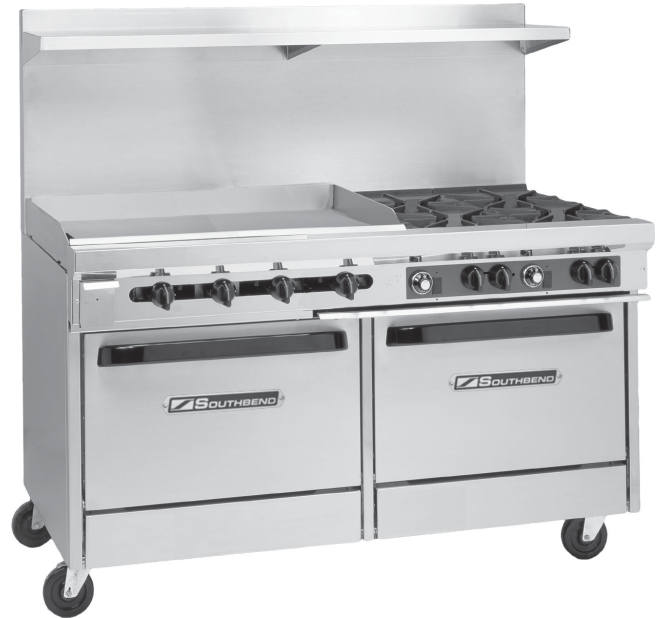
(shown with optional casters)