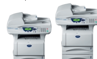
DCP-8045D Without / with lower tray ■ Optional Network Interface ■ Duplex Printing as Standard