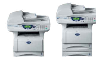
DCP-8045DN Without / with lower tray ■ Network Interface as Standard ■ Duplex Printing as Standard