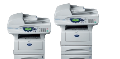
DCP-8040 Without / with lower tray ■ Optional Network Interface