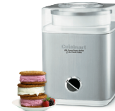
Ice Cream Makers

Cuisinart offers an extensive assortment of top quality products to make life in the kitchen easier than ever. Try some of our other countertop appliances and cookware, and Savor the Good Life®.