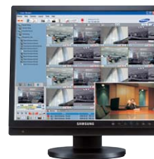
PIP (Picture in Picture)

The picture-in-picture or picture-by-picture capability allows a security manager to use a PC and view a CCTV camera at the same time. It could also allow the manager to always have a video of important camera in the corner at all times.