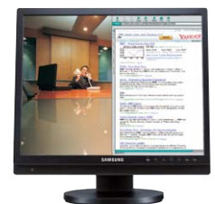
PBP (Picture by Picture)