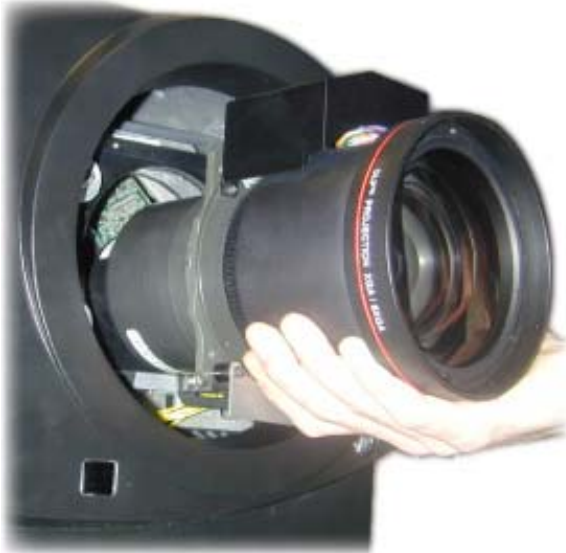
Image 1-3 Take the lens out of the lens block