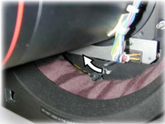
Image 1-2 Move the handle of the lens anchor system to the left