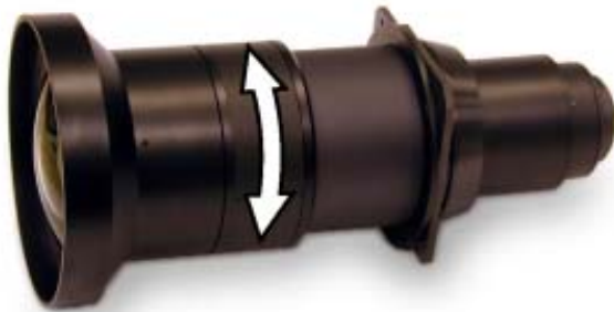
Image 1-5 Rotate the lens barrel for picture focusing