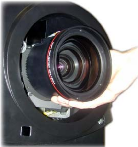
Image 1-1 Support the lens with one hand