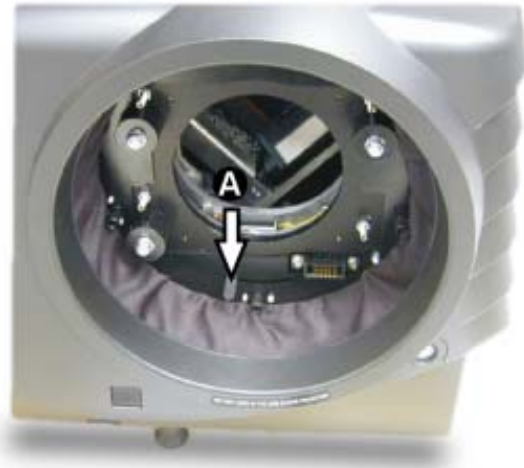
Image 1-4 Lens installation

Caution: For a table mounted projector, hold the projector when pushing the lens into the lens block to avoid sliding off from the table.