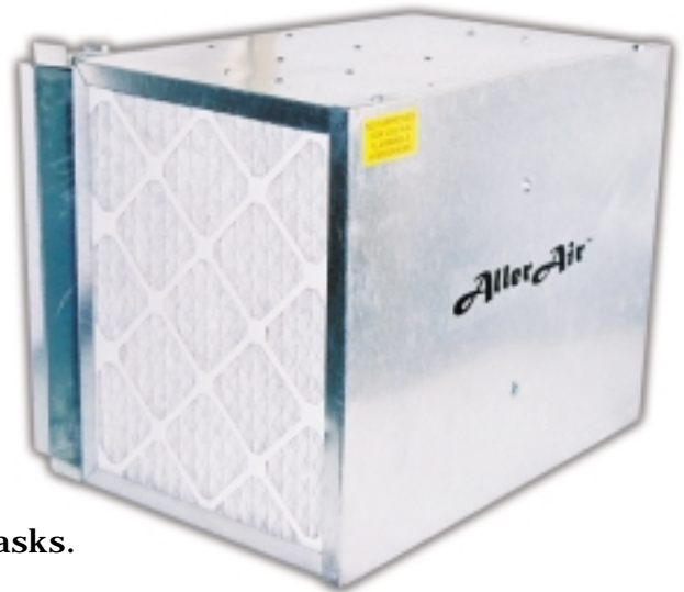
AllerAir™ Sentry TAC 2000