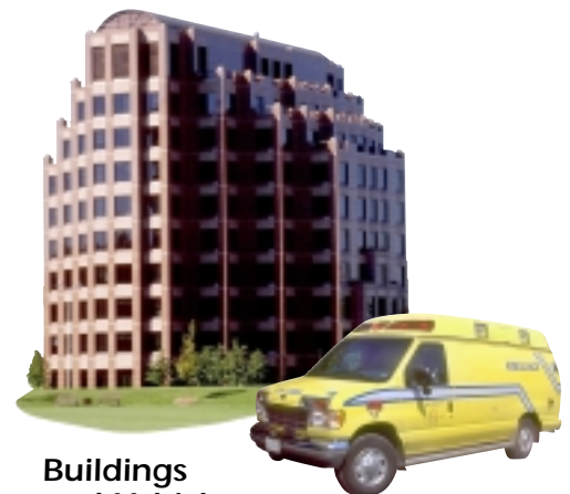
Buildings and Vehicles

To exhaust a contaminated room, you close the small 180 CFM fan and open the side vent (Either manual or electric) then turn on the large 1600 CFM fan for exhausting.