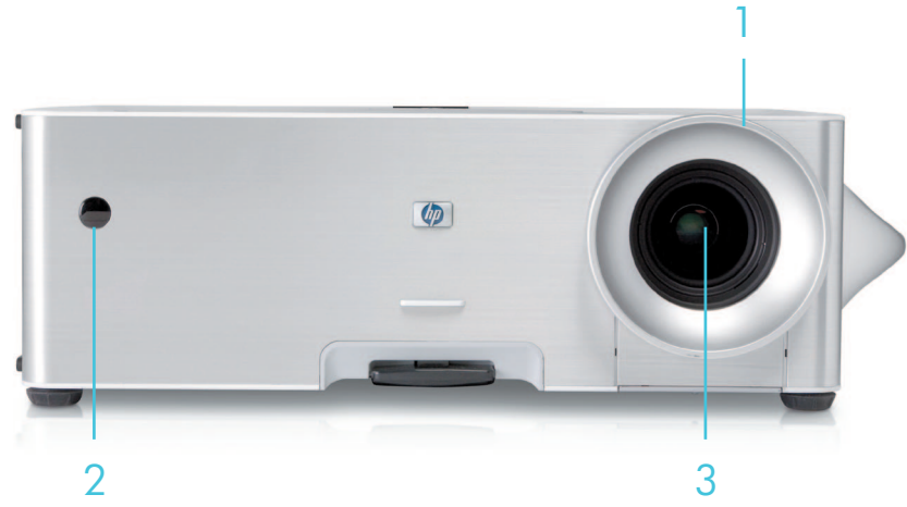
HP Digital Projector xp8010 shown