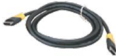
HDMI Cable (not included)