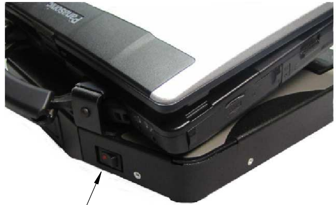
Dock Power Switch