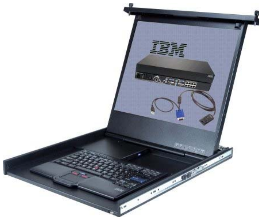
Figure 1. IBM 1U 19-inch Flat Panel Console Kit with the IBM UltraNav USB US English keyboard

These kits include either a 17" or 19" LCD display and accept an UltraNav keyboard available in 29 languages (the keyboard must be ordered separately). The 19-inch kit also includes as standard a multi-burner drive and USB port for additional convenience.