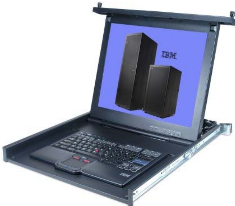
Figure 2. IBM 1U 17-inch Flat Panel Console Kit with the IBM UltraNav USB US English keyboard

Note: The console kits do not include a keyboard. See Table 2 for the supported USB keyboards and Table 3 for the supported PS/2 keyboards.