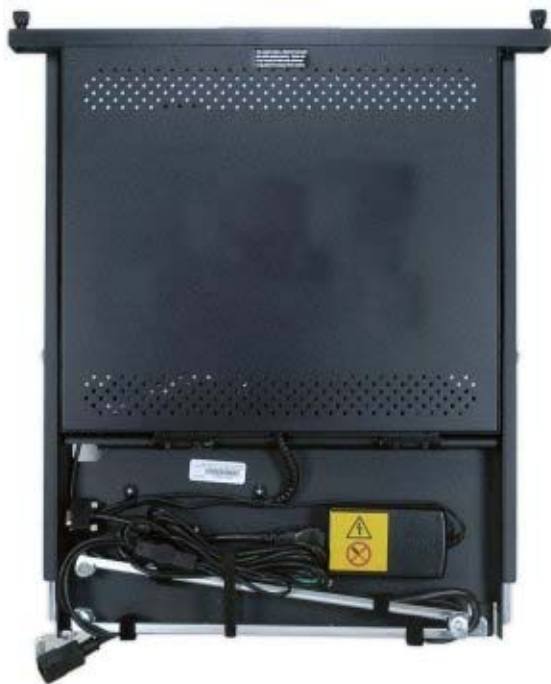
Figure 4. IBM 1U 17-inch Flat Panel Console Kit

Figure 4 shows the 17-inch Flat Panel Console Kit in the closed position.