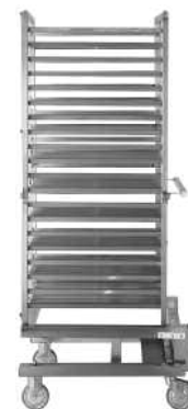
ROLL-IN PAN CART