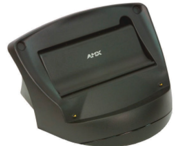
ViewPoint Docking Station