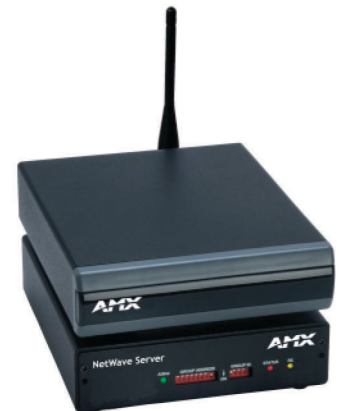
AXR-RF NetWave Server