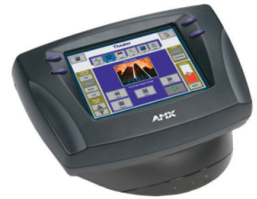
ViewPoint Touch Panel