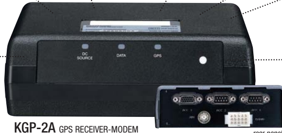
KGP-2A GPS RECEIVER-MODEM

The KGP-2A/2B air protocol commands permit a KGP-2B base unit to request any KGP-2A fleet unit to send any currently stored data or mobile station settings. AVL mapping / dispatch CAD software developers are provided with these commands and all protocol information to utilize in their products.