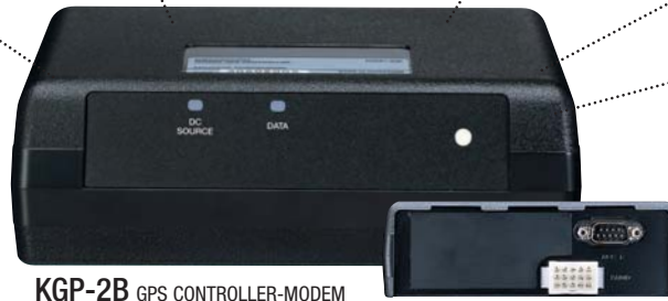
KGP-2B GPS CONTROLLER-MODEM

Flash memory permits uploading KGP-2A/2B unit firmware upgrades with a computer.