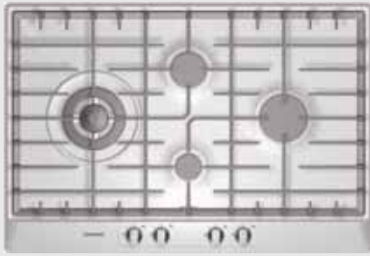
30" Stainless Steel Gas Cooktop