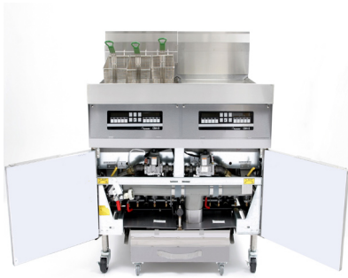
FPH265G Shown with optional computers, filtration and casters

*Matching cabinet required for optional filtration.