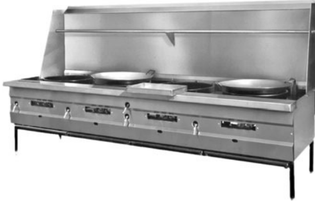
JCR-4 (four 20" holes)