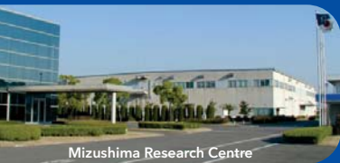
Mizushima Research Centre

Verbatim is a subsidiary of Mitsubishi Kagaku Media, based in Japan. Mitsubishi Kagaku Media's wide-range of operations makes it one of the leading chemical companies in the world.