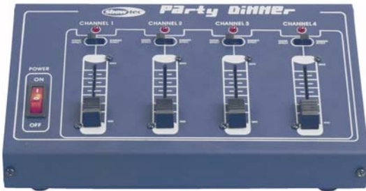
4 Channel Dimming Pack with Schuko Connectors