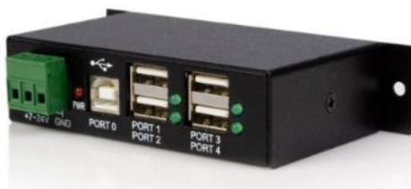
StarTech 4-port USB hub

Antennas: The use of an externally-mounted antenna is optional. GRT beta testers in Van's RV aircraft have reported good signal with the included antenna when the unit is within view of the sky (typically on the instrument panel glare shield). Signal reception may be improved by mounting an antenna on the belly of the aircraft. The included antenna may be removed and a dedicated passive transponder or DME antenna may be connected in its place.