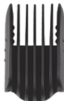
5-Position Attachment Comb