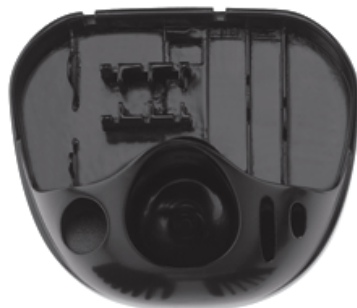
Charging and Storage Stand