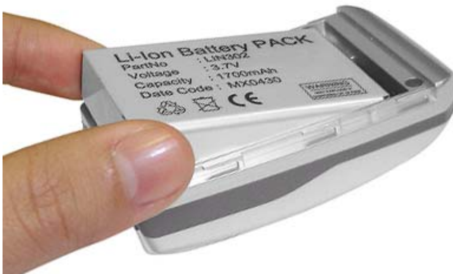
Figure 3 Put new battery into BT-338