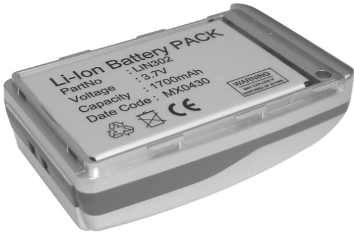
Figure 4 Fit battery into BT-338