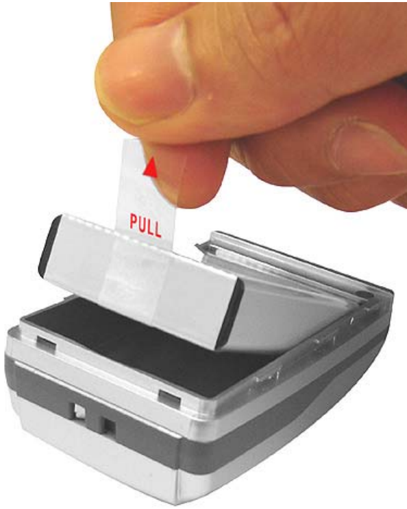
Figure 2 Take out the battery with pull tag