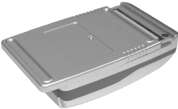
Figure 5 Slide the cover of battery to close