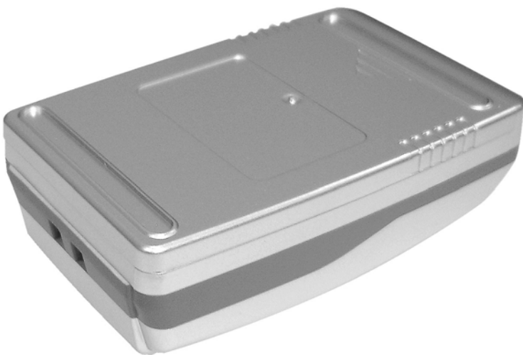
Figure 6 Slide the cover of battery to close