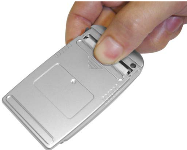
Figure 1 Open the cover of battery