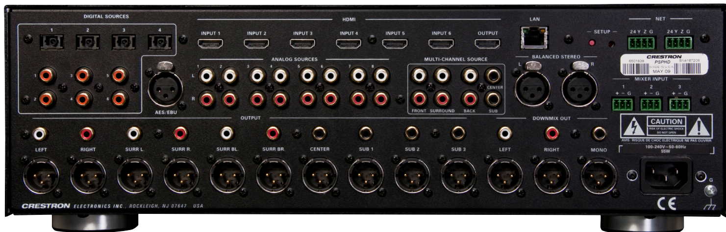
PSPHD – Rear View

To accommodate inputs from your microphone mixer and teleconferencing codec, the PSPHD includes a built-in 3-channel line mixer. Independent mono and stereo “downmix” outputs are also provided to feed the mix-minus signal back to the codec, and to send your own mix of signals to recorders and assistive listening equipment. Each mixer input features independent control over the signal level going to each of the individual main, surround, rear, and downmix outputs giving you complete control over which signals are heard from each speaker in the room.