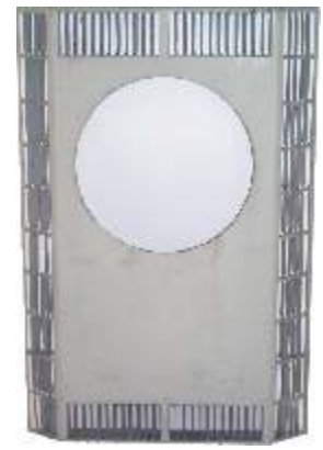
STAMPED LOUVER (REPLACE)

To reinstall unit, reverse the procedure outlined above. Always check to see that the chassis is sealed to the wall sleeve to prevent water and air leakage. Replace or add seals as needed.