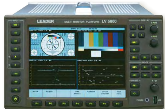
(Mfr # LV5800 • B&H # LELV5800)

The LV5800 comes with four slots for input options and two slots for output options. This allows you to freely configure or construct a versatile system by combining dedicated input and output units. In particular, simultaneous display and error monitoring of multiple SDI inputs are possible, and four-waveform parade display on the waveform monitor is also supported. In addition, the modules are field installable and replaceable, so you can add additional functions as your needs grow. The upgrade modules include: SDI Input, Composite Video input, Eye Pattern, DVI-I Output, and AES/EBU input/output.