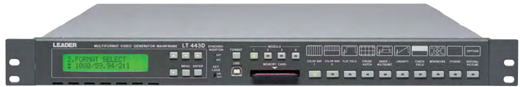
(Mfr # LT443D • B&H # LELT443D)

The LT443D is ideal where multiformat digital broadcast systems are the norm. With plug-and-play modules available for HD-SDI and SD-SDI generators, genlock,