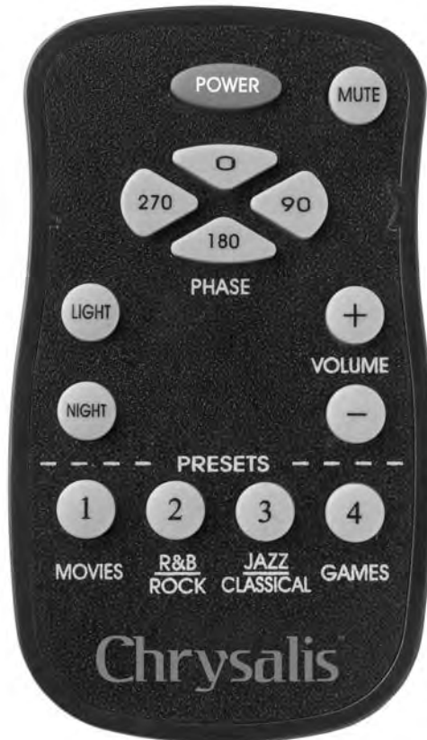
Figure 2. Remote Control

Figure 2 shows the remote control, enabling you to easily choose whatever listening mode you desire.