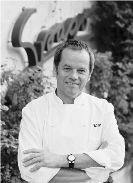
Wolfgang Puck, owner of the famous Spago restaurants and one of the most influential chef-restaurateurs in America, is credited with reviving California's rich culinary heritage. His cooking innovations, a result of blending fresh

California ingredients with his classical French techniques, are enjoyed by world leaders, stars and fellow chefs alike. He established other trend-setting restaurants like Postrio, Chinois on Main in Santa Monica, Trattoria del Lupo, Cut, and his latest creation, Jai, an Asian fusion restaurant in San Diego. Home chefs can also share Mr. Puck's talents through his cookbooks, cutlery, cookware and, of course, through his appliances!