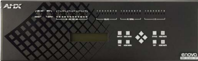
FIG. 1 Enova DVX-3150HD-SP 10x4 All-In-One Presentation Switcher (front panel)

The following table lists the specifications for the Enova DVX-3150HD/3155HD 10x4 All-in-One Presentation Switchers: