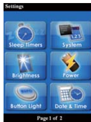
Page 1 of the Settings Screen