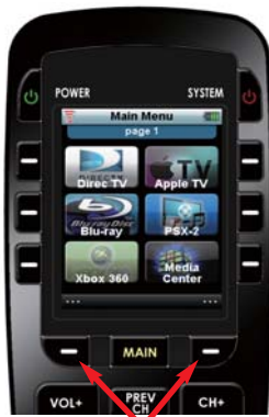
Page buttons reveal the rest of the settings.

There are two pages of Settings screen. To access the other page, press either of the PAGE buttons.