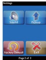
Page 2 of the Settings Screen