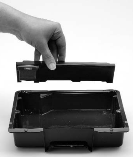
STEP 2 Place the Drip Tray full Indicator into the the Drip Tray and then place the stainless steel grid on top. Slide the Drip Tray into the base of the machine in front of the Storage Tray.

Insert the Storage Tray into the base of the machine and slide in towards the back wall. This is a convenient location to store the Cleaning Tool, stainless steel Filters and Measuring/tamping Spoon when not in use, so they are not misplaced.