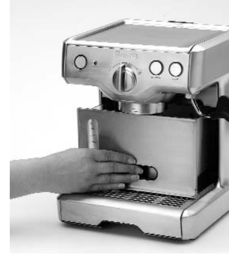
STEP 3 Slide the Water Tank over the Drip Tray and into the front opening of the machine and into position above the Storage Tray. Ensure the Water Tank aligns flush with the sides of the machine.

Before first use: It is recommended to complete a water brewing operation without ground coffee before brewing your first espresso coffee to ensure that all internal piping has been preheated (follow Steps 1 and 4 in Operating your Breville 800 Class Espresso Machine – Pages 13 and 15).