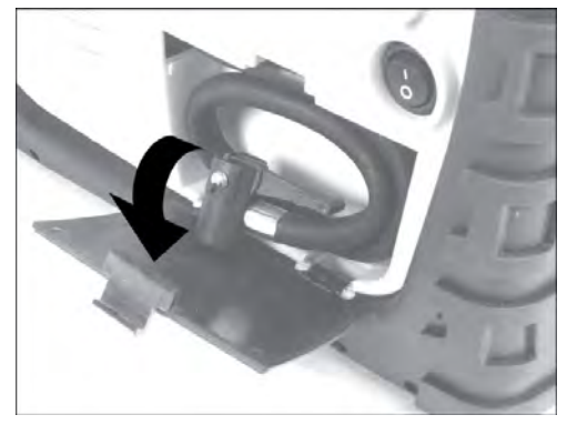
Compressor hose compartment