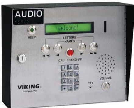
AES-2000S Surface Mount

The built in directory can support up to 525 tenant names and phone numbers and will dial a pre-programmed phone number upon selection of a tenant. Once two-way communication has been established, the tenant can activate a remote door strike by entering a Touch Tone command. A second relay is also provided to operate an automatic door. The AES-2000/AES-2005 will also support keyless entry at the door via its built-in keypad, or by adding proximity card readers, such as the Viking PRX-1, PRX-2, PRX-3 or PRX-4 .