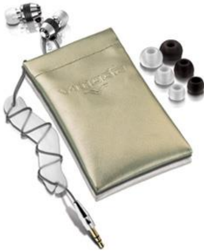
Out of Box Accessories Shot