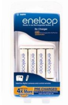
Product Packaging Shot