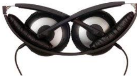
Folded / Transformed Shot (if applicable)