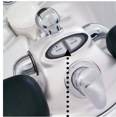
On/Off & Drain Button as with PDP option

Note: Pressing with finger nails, rather than the pads of fingers, can damage the on/off switch and will not be covered under the warranty.