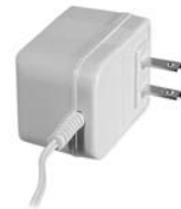
AC Power Adapter