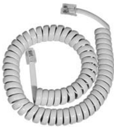
Handset Coil Cord