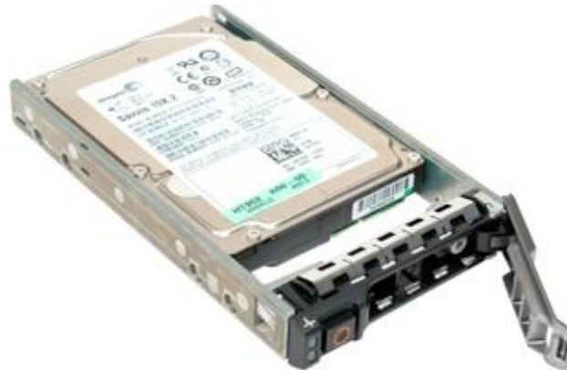
Figure 6. 2.5” Hard Drive Carrier

The M915 supports the Dell eleventh-generation 2.5” hard drive carrier (see Figure 6). Legacy carriers are not supported on the M915.