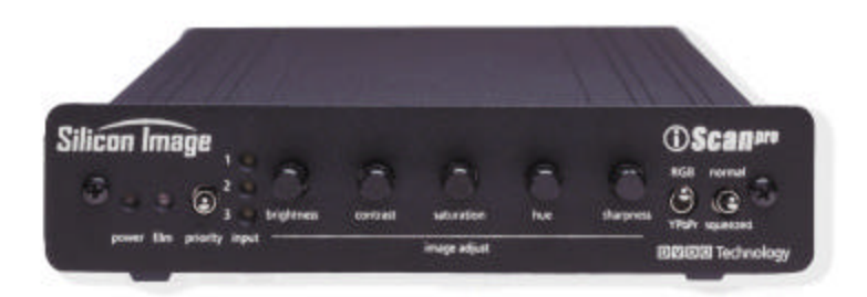
Figure 2: Picture Controls (Front View)

To adjust a picture control setting, turn the potentiometer clockwise to increase the setting or counterclockwise to decrease the setting. This is shown in the figure below.