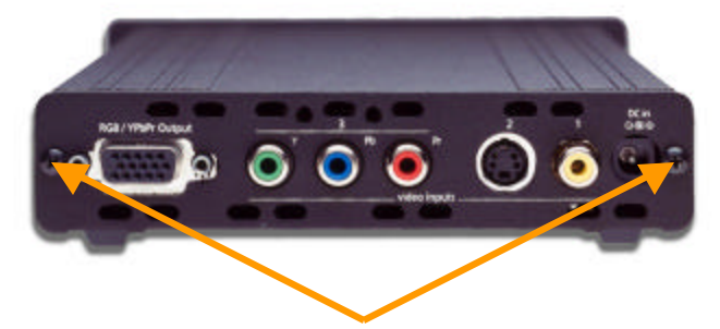
Rear Panel Screws

Find an electrostatic-free environment to work at. Having no carpeting or static-free carpeting is strongly recommended. If you can find an area with some heavy metal parts within easy reaching distance, touching these will allow you to discharge yourself before beginning work.