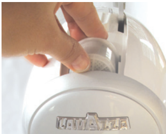
Step3 - insert new coffee pod