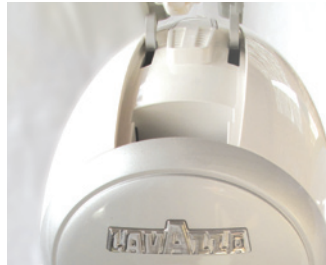
Step2 - view empty cartridge opening