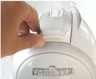
Step1 - Using the lever grip, open cartridge lever