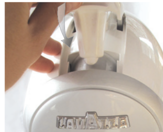
Step4 - close lever, coffee pod will drop into place