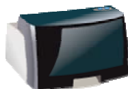
Bravo Pro DISC PUBLISHER