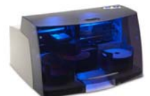
Bravo 4100 Series

Primera Technology Inc. September 20, 2011 / Revision 3.24