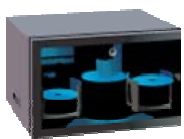
Bravo™ XRP DISC PUBLISHER