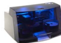
Bravo Pro Xi Series