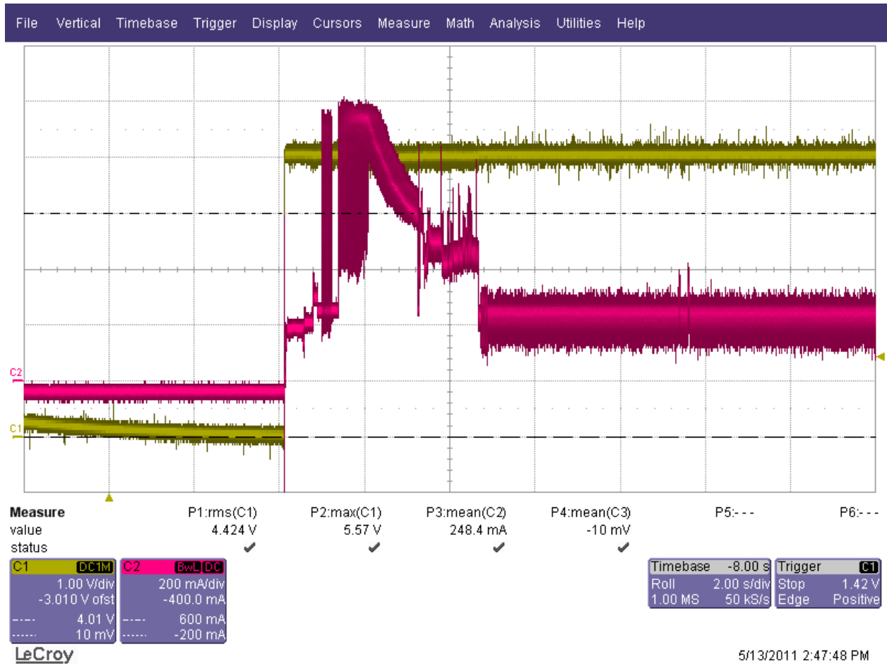
Figure 1. Typical +5V only startup and operation current profile