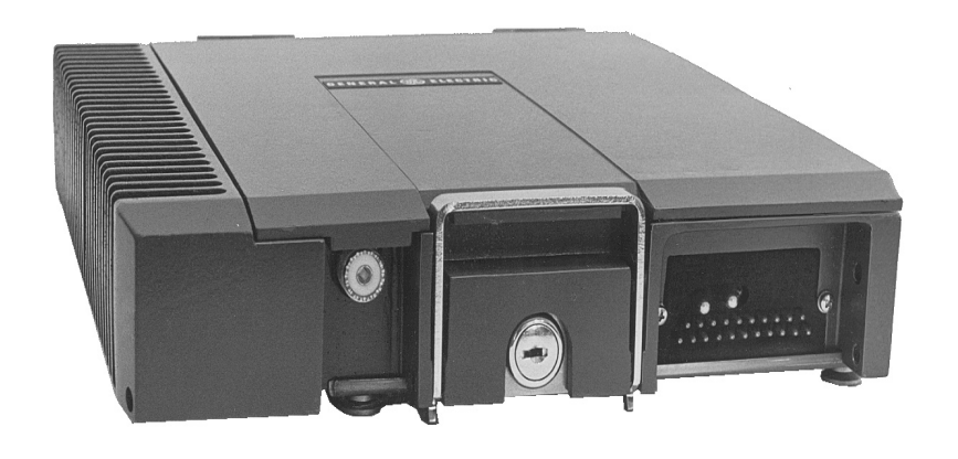
65-110 WATT MOBILE RADIO

DELTA-S NARROW BAND, SYNTHESIZED 403-430-450-512 MHz Mobile Communications (NEGATIVE GROUND ONLY)