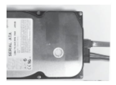
Figure 2. Hard disk drive connections

3. Connect one end of the Serial ATA cable to the hard disk drive.