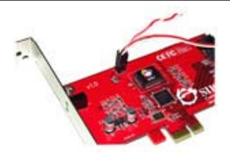
Figure 4. Connecting HDD LED

Note : If it is your desire to monitor disk activity of the Serial ATA hard drives, you may at this time connect the hard disk LED of the system case to the Hard Disk LED Pins on the Serial ATA controller.