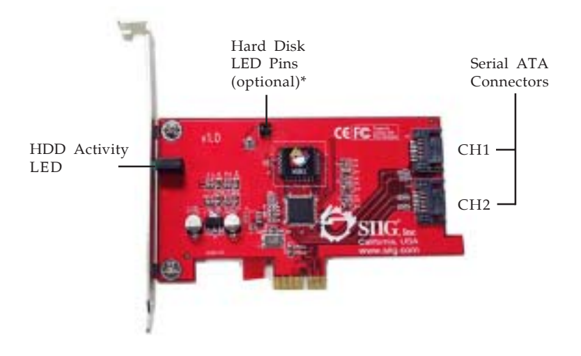
Figure 1. SATA II PCIe RAID layout

* Note: Connect the hard disk drive activity LED of the system case to the pins horizontally. This connection is optional.