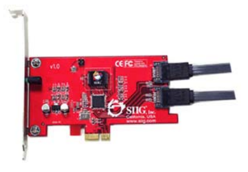
Figure 3. Connecting the Serial ATA data cable(s)

4. Attach the other end of the Serial ATA data cable to the Serial ATA connector on the SATA II PCIe RAID .