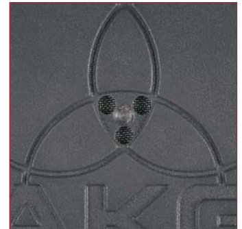
Sound entry ports on C 542 BL top