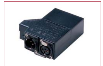
Optional B 18 battery power supply