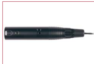
XLR connector with integrated bass cut filter