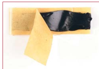
Adhesive compound for easy installation