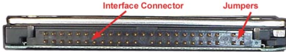
Figure 1. MK6409MAV HDD Rear View - Connectors